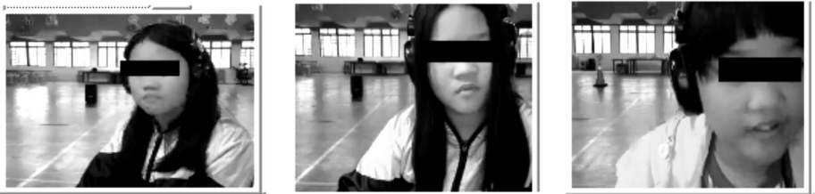
Figure 3 Screen Shot Showing Tutee's Facial Expression During the First, Second, and Seventh Weeks

observed that communication between the tutors and tutees was mostly through text, not much of talking from the tutees side. However, as time progressed, in the last weeks, the tutees were noticed to be comfortable and felt much at ease. With time, they started to talk freely with their tutors and no longer seemed to depend on their resident teachers. In addition, they responded in English most of the time, they were more enthusiastic and participated actively during the sessions, payed more attention, and portrayed positive facial expressions (as shown in Figure 3). Thus with time, based on the observed videos, the interaction between tutees and tutors increased, and tutee participation and attention also improved. They were observed to be more on-task with the tutors than off-task as seen in the videos during the first weeks, and also more talkative. This implies that the project was not only of benefit to the international students but also benefitted the rural children. In fact, the tutees' resident teachers reported that the children were willing to participate in the project the following semester.